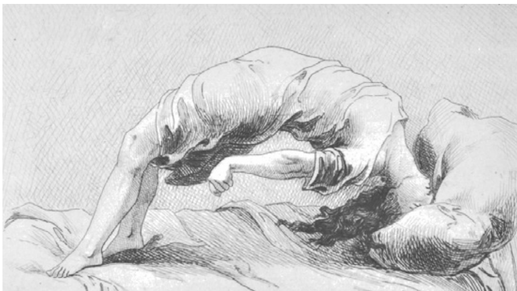
Fig. 3. The ecstatic posture called arc de cercle or opisthotonus (Richer 1881, pl. III).