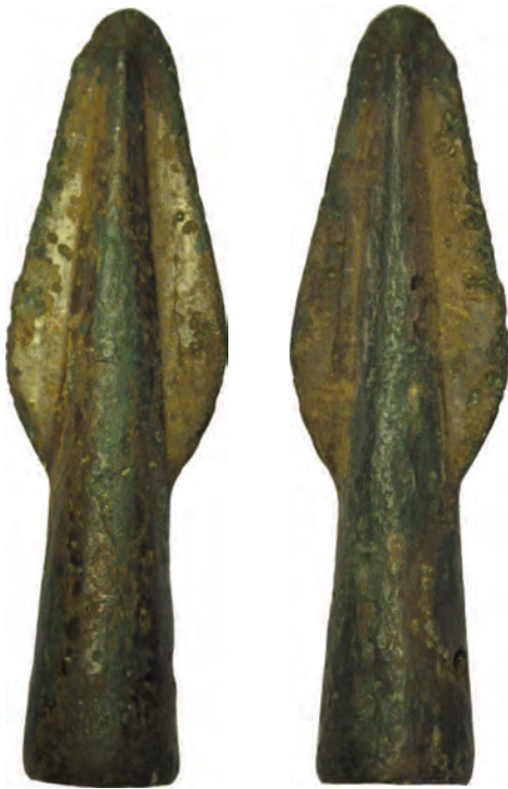
Fig. 1. Spearhead from the Västervik area. Length 12 cm.

This incomplete spearhead measures 170 x 31 x 15 mm and should belong to types Kirke Såby or Ullerslev, because of its narrow, elongated shape