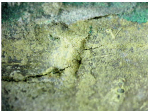
Fig. 3. Possible decoration on the Västervik spearhead (x60).