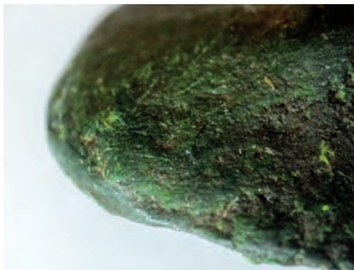
Fig. 4. The tip of the Västervik spearhead (x60).

and the transition of the edges onto the socket close to the socket mouth, right above the rivet holes. A close parallel is found in a hoard from Fröjk in Denmark (Jacob-Friesen 1967, Pl. 60.8). Both spearhead types as well as the hoard date from Per. II (Jacob-Friesen 1967, p. 141 f; Oldeberg 1974, no 1762). It was found at the farmstead Ramstad in Gamleby parish and incorporated into the collection of a nearby school (Gamleby Folkhögskola) before being given to Kulbacken Museum in Västervik (KUM 4040).