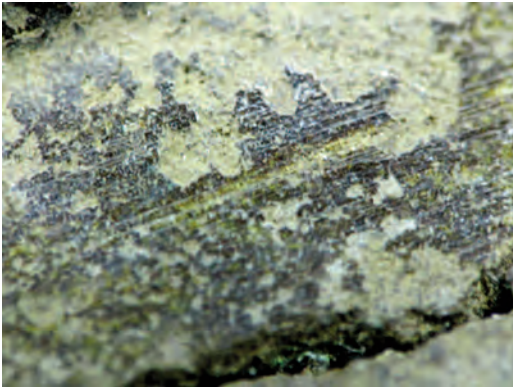
Fig. 5. Grinding striations on the Västervik spearhead (x150).