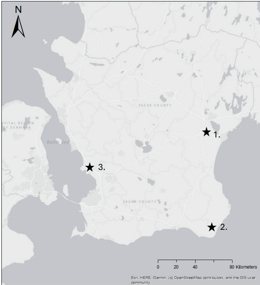
Fig. 1. Distribution of the sites: 1) Öllsjö 7, 2) Carlshögen, 3) Gillhög. Map created by Tornberg using ArcMap 10.5.1. by Esri.

context by Märtha Strömberg (1947). Interestingly, the passage grave was clearly modified, plausibly in the Late Neolithic, to resemble a gallery grave. A lower, Middle Neolithic, layer, was then sealed off by a stone paving, one of the gable stones was removed and the passage was destroyed. The lower layer contained FBC pottery sherds, as well as Middle Neolithic A (MNA) flint and amber objects and a complete BAC vessel. The upper layer was clearly of later date and attested to LN and Early Bronze Age (EBA) activity: bone and flint artefacts, pottery